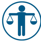
Balance & Sway Analysis