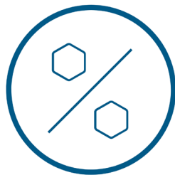
Average Activation Patterns