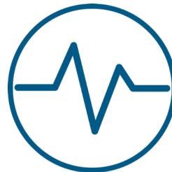
EMG Amplitude Analysis