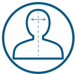
Symmetry & Coordination Tests

Noraxon EMG allows users to integrate with various other recording devices to fit unique applications such as: