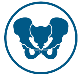
Pelvic Floor Therapy