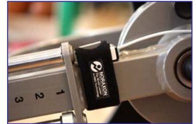
Machine motion sensor - mounted to the lever arm