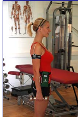
Shoulder ab/adduction and extension/flexion