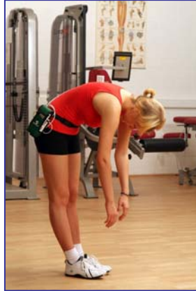
Trunk flexion/extension and lateral flexion

The sensor can be used to detect the joint motion of most major joint regions: Hand, arm, shoulder, head, trunk, thigh, shin, and foot.