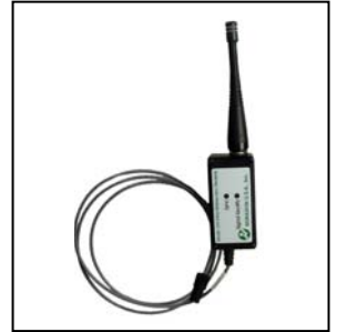
Small and lightweight Wireless Sync Receiver

The Wireless Sync feature includes a small and lightweight Sync Receiver, a start trigger cable with manual button and an output cable to connect to another device. The synchronization function is bidirectional allowing timing signals to be either sent to or received from third party devices. This mode is helpful e.g. in case another biomechanical device cannot be triggered via the output signals but can send or receive a standard TTL sync signal. The synchronization pulse is sent wirelessly to the Wireless Sync Receiver, which is connected to the sync channel of the TeleMyo G2 system. The start trigger cable allows you to comfortably send a start trigger to all connected devices with a “push of one button”.